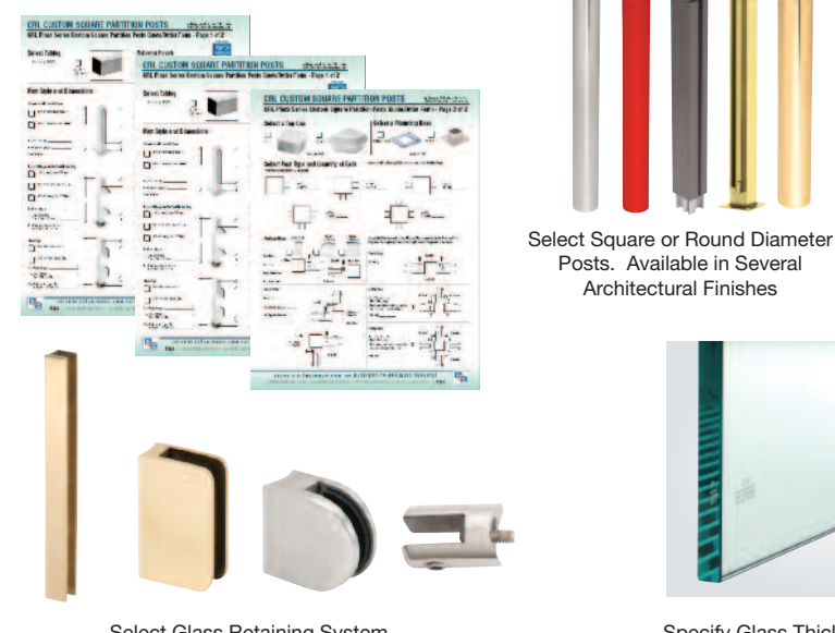
Posts. Available in Several

It's easy to specify what you'd like. Inside CRL's HS12 Hospitality and Food Service Hardware Catalog are Post Quote/Order form pages. These pages are a valuable research tool to help you realize your vision and select the right products for your job. Ask for HS12 or access it online at crlaurence.com.