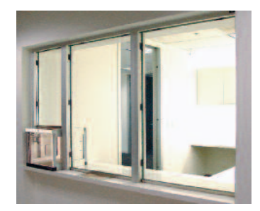
Inset Frame Multi-Lite Window with Clear Package Receiver and Surround Sound

Interior Bullet Resistant Sliding Windows