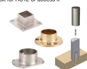
Select Base Style