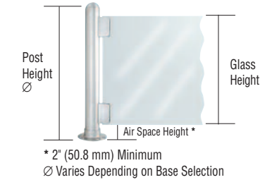
Provide the Three Required Dimensions